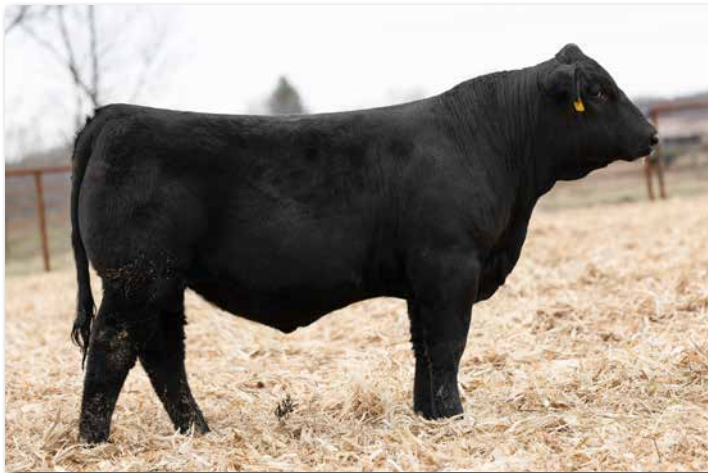
DRAKE BULL K104M Sells as Lot 64.