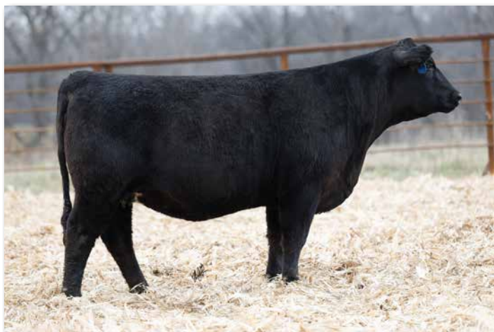
DRAKE MISS H107L Sells as Lot 102.

Bred to Five Star Jackson (3947790). Confirmed safe and due 2/22. Confirmed bull calf.