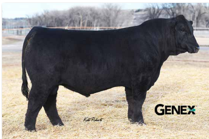
LBR5 GENESIS G69 Sire of Lot 17.

Another "something different" for those looking for a Matron son. Sired by the power bull, Genesis, Eruption provides the growth we expect from Genesis with the calving ease and maternal and carcass traits virtually guaranteed by Matron. Study this guy closely and you find no holes -top 25% in 14 traits including top 25% calving ease, with top 5-10% growth, top 10-25% maternal traits, top 1% marbling with a staggering 184 API and 108 TI. This bull will work for the seedstock producer or the aggressive commercial breeder.