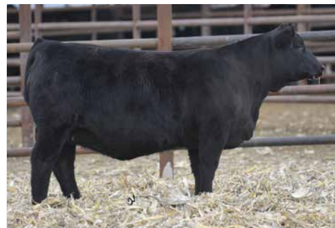
CCR MS 6175 GUARD 1003J Dam of Lots 23 & 24.

This Warpaint son is an attractive baldy that has a solid set of EPDs. He also gained 4.4lbs a day.