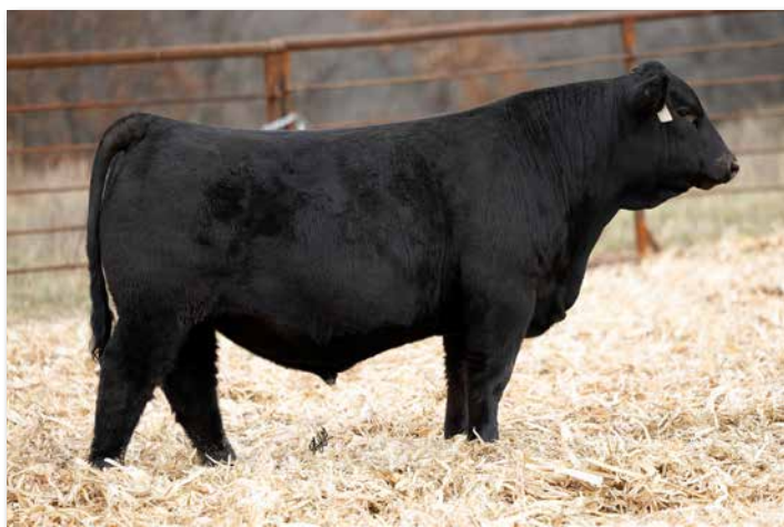
DRAKE BULL A365M Sells as Lot 56.