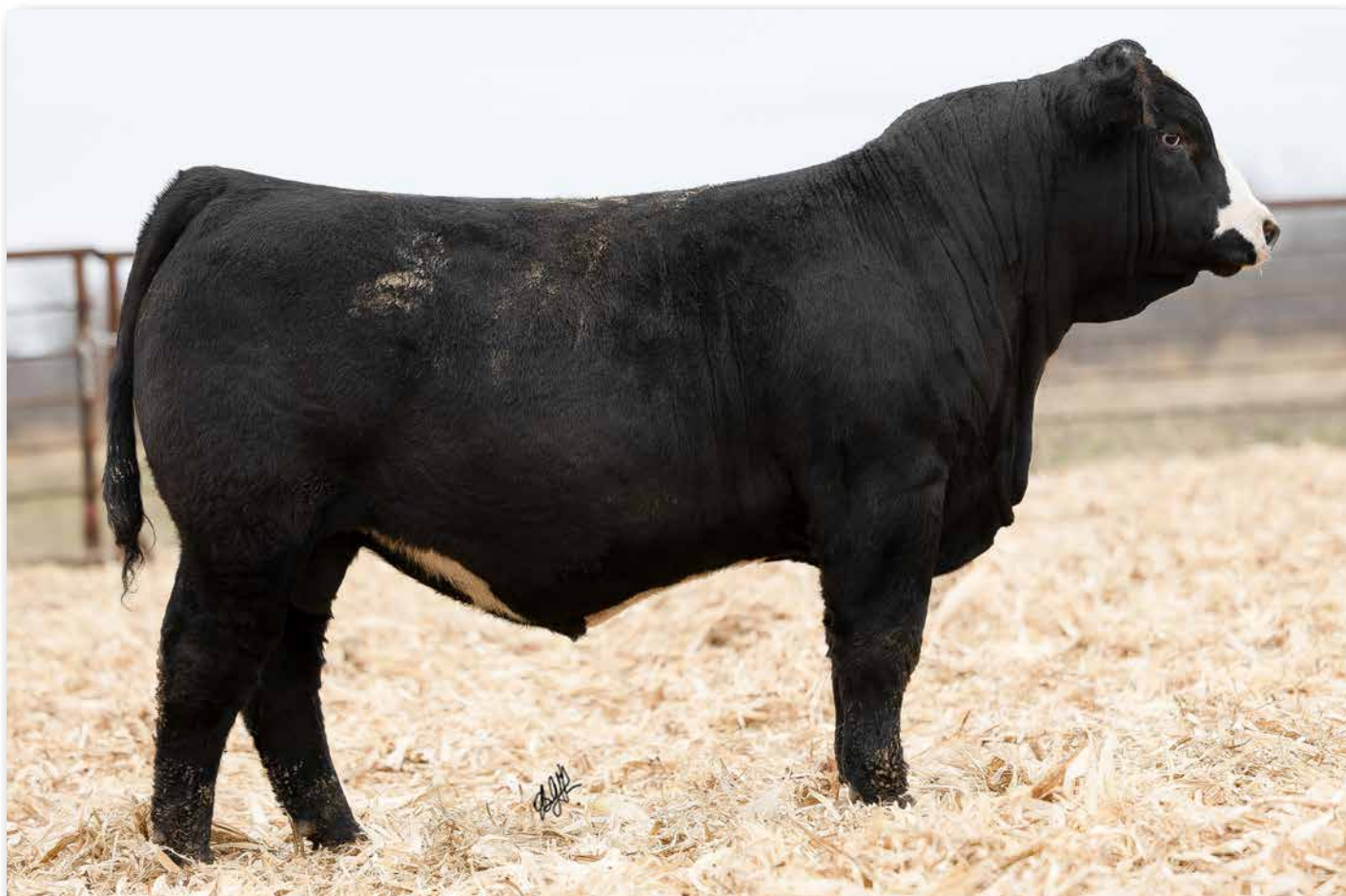
DRAKE GENESIS M3 Sells as Lot 53.