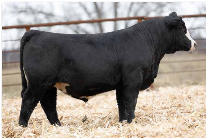
HARLAN BULL G75M Sells as Lot 45.