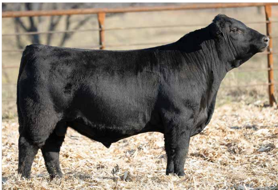
IRON CREEK DEADWOOD 3286L Sells as Lot 19.

GROWTH!! I believe 3286 is the top weaning weight, yearling weight and average daily gain EPD bull in the sale-elite top 1% EPDs in every one of these traits and top 1% for carcass weight, marbling and Terminal Index with a super strong, top 2%, API of 182. If you are selling pounds and/or quality meat-3286 is your man.