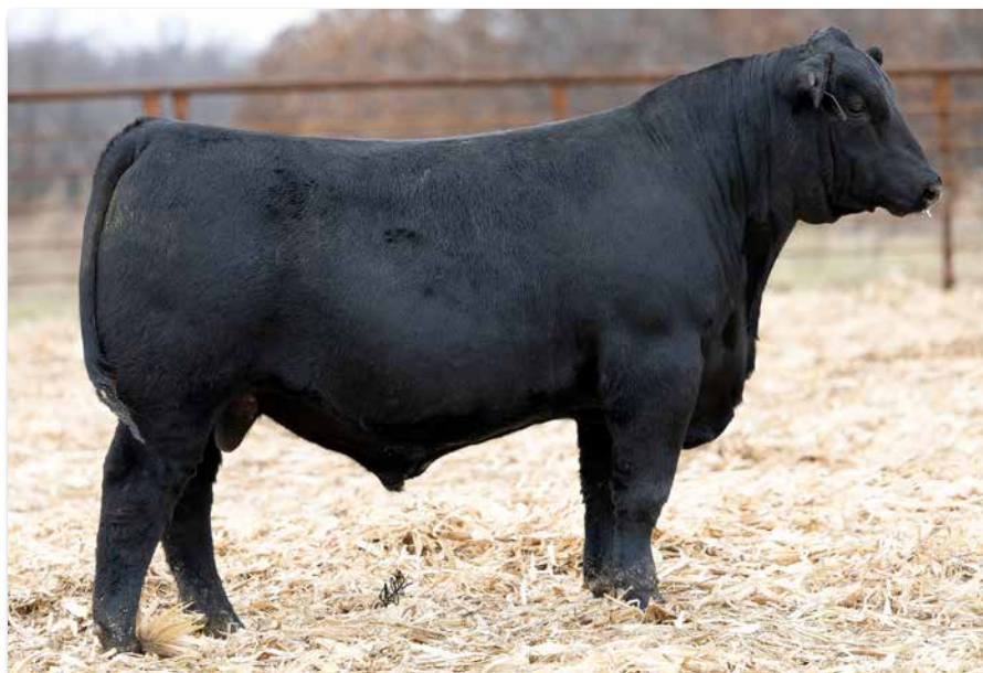
IRON CREEK BLACKBIRD B37M Sells as Lot 21.

Love this bull- 12 traits in the top 15% of the breed including top 15% calving ease combined with top 10% weaning weight, 3% yearling weight and 2% average daily gain. Outstanding maternal traits with top 20-25% ribeye area and marbling. A beast that will add pounds to your calves and give you outstanding daughters that will do the same! GAINED 5.32 POUNDS PER DAY FOR A 1424 POUND YEARLING WEIGHT!