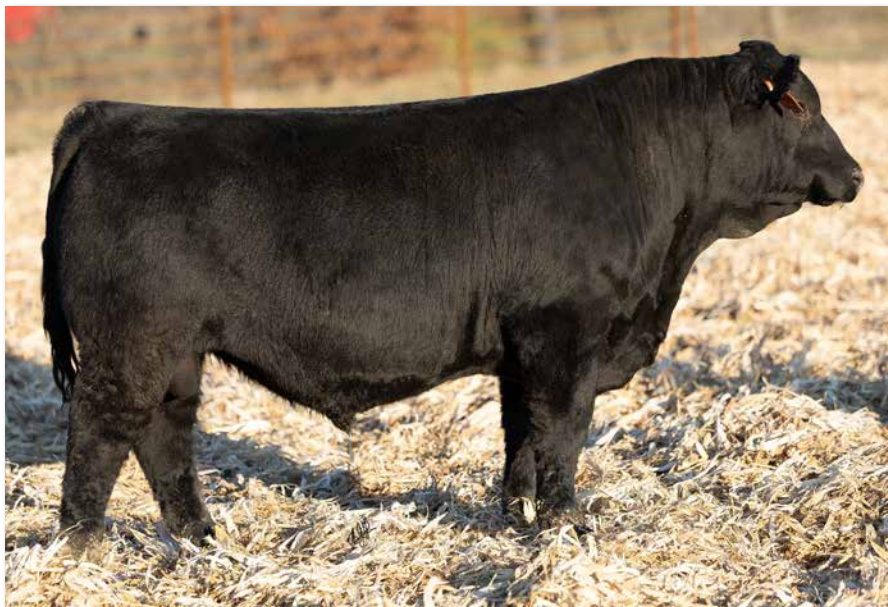
IRON CREEK WAR PAINT 014M Sells as Lot 23.

Out of our beautiful Guardian daughter purchased from Cow Camp Ranch and sired by War Paint, 014M is double bred big bodied and carries great balance across his EPD profile, resulting in a top 3% API of 177 and top 10% TI of 96. A stout breeding bull.