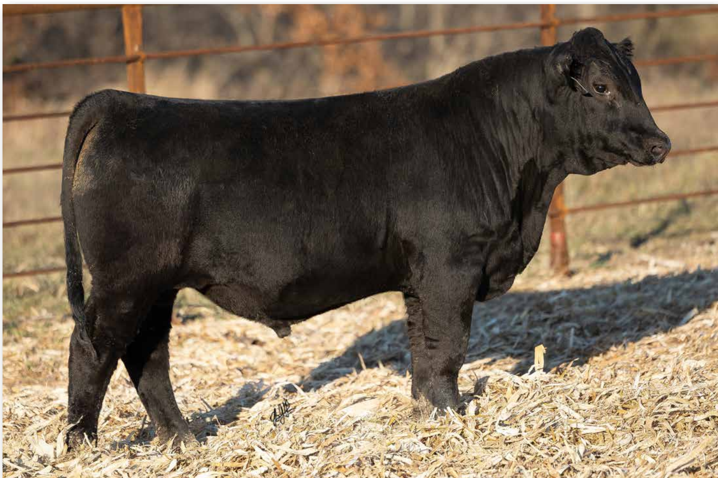
IRON CREEK ERUPTION 531M Sells as Lot 17.