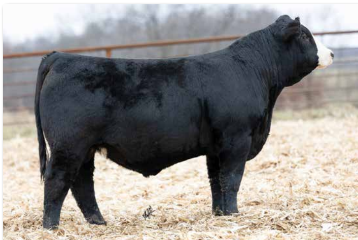
IRON CREEK G959M Sells as Lot 51.

A War Paint son with a great look and top 10% milk, 5% maternal weaning weight and 10% stay. If you keep your replacement females from your own herd, 959M will improve those heifers.