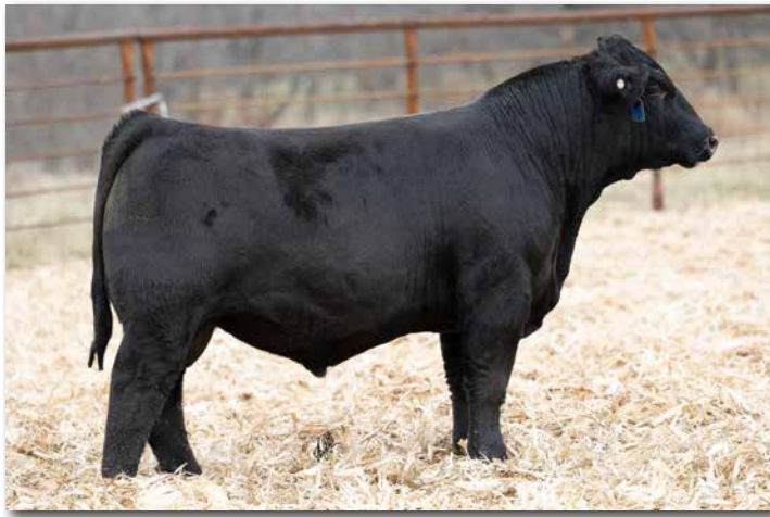
DRAKE WOODY Sells as Lot 69.