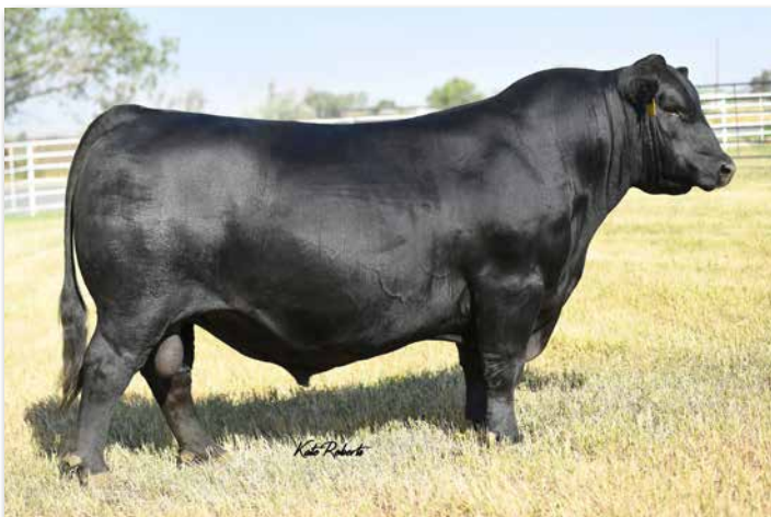
DB ICONIC G95 Sire of Lot 9.