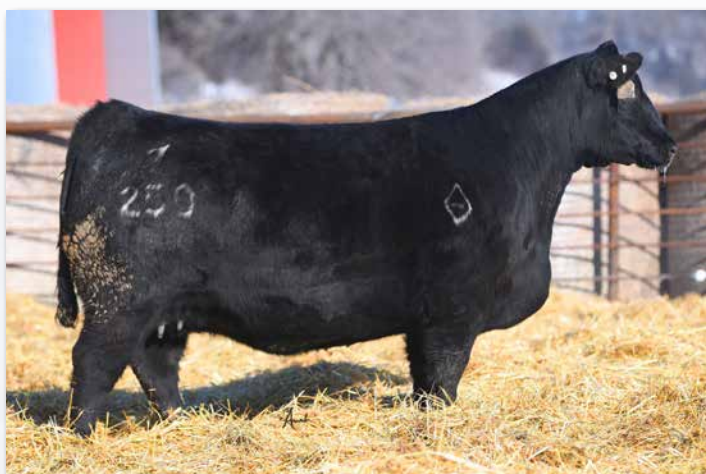
MONTANA BLACKBIRD 7250