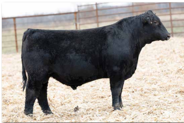
IRON CREEK RISEN 838M Sells as Lot 54.