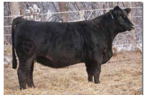
KBHR MATRON OF HONOR F202 Dam of Lots 11 & 12.

It is so much fun to have bulls like these to offer. 033M personifies the broad based genetic excellence that has been our family's goal for 170 years- top 20% calving ease, top 3% growth, top 1% carcass weight, ribeye area and TI, top 2% marbling and API. Gained 4.75 pounds per day and posted a 1388 pound yearling weight.