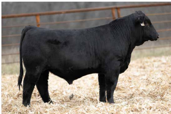
DRAKE BULL G765M Sells as Lot 46.