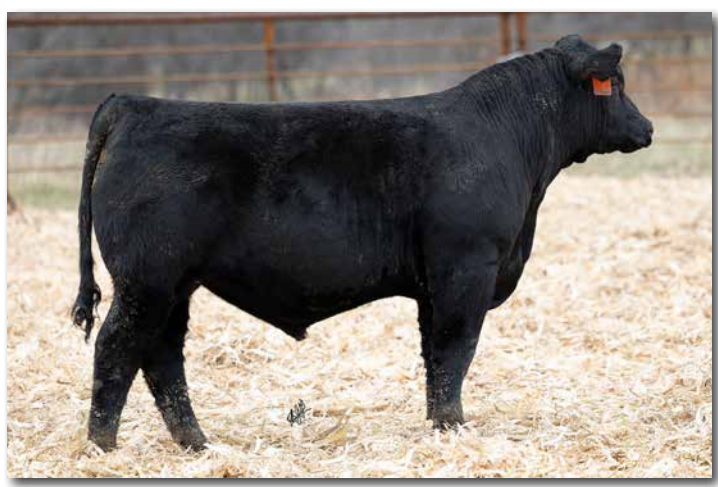
HARLAN BULL J26M Sells as Lot 72.

A half-blood Deadwood son with a balanced set of EPDs putting both his API and TI in the top 10%.