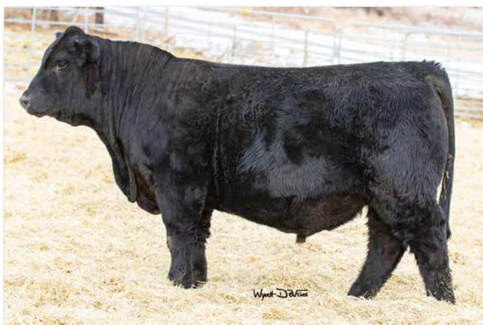
BSUM MOST WANTED