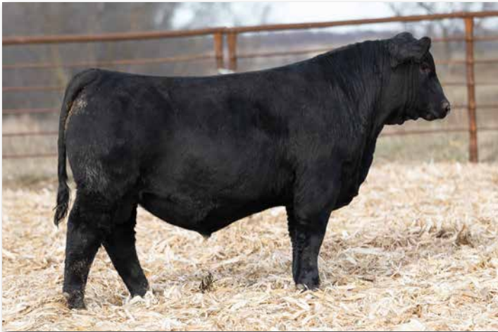
DRAKE BULL M6 Sells as Lot 49.

A beautiful Jackson son with tremendous muscle and shape. A combination of calving ease and superior phenotype.