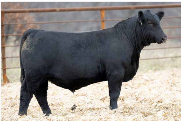
IRON CREEK 3007M Sells as Lot 44.

This bull looks a lot like Jackson himself. Posting one of the top weaning weights in the sale at 777 lbs. and a 1352 lb. yearling weight, M48 is a powerful combination of balanced phenotype, power and growth.