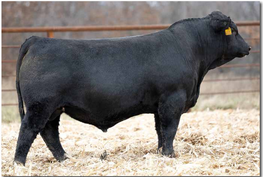
IRON CREEK MANIFEST 1004L Sells as Lot 18.