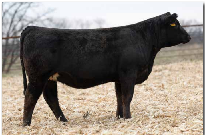
DRAKE MISS A49L Sells as Lot 89.

Bred to Five Star Jackson (3947790). Confirmed safe and due 2/17. The Speak Now females have been outstanding for us- moderate framed, super docile with a deep rib and nice fronts. And Y23L is out of a cow we purchased from Denny Drake that makes a good one every single time-which is why she is still here at almost 14 years of age. Bred to Jackson with a bull calf.