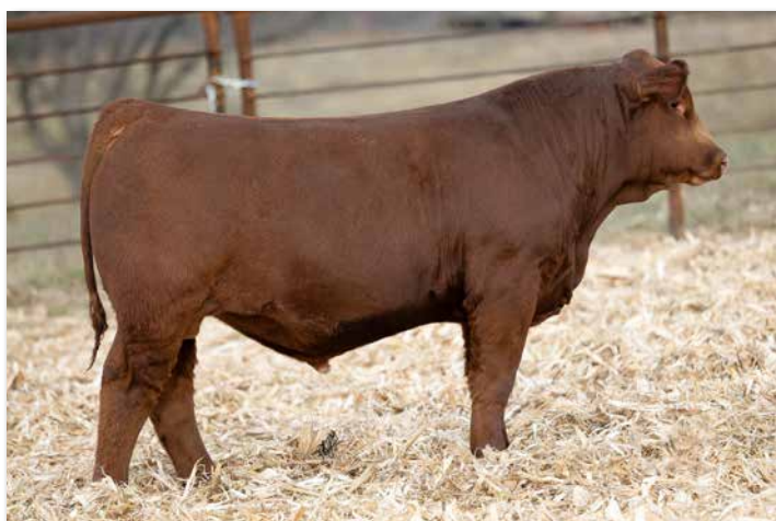
DRAKE BULL G21M Sells as Lot 35.