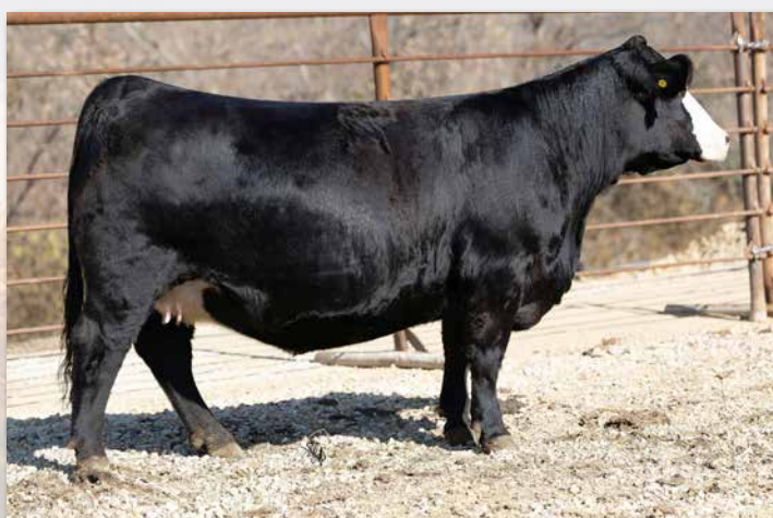
IRON CREEK MOXIE D68K

This full sister to the $30,000 Iron Creek Overhaul displays an outstanding phenotype with elite genetics-top 15% calving ease, 1% average daily gain, carcass weight, marbling, All Purpose Index (199!) and Terminal Index (113!). Embryo calves arriving January 2025.