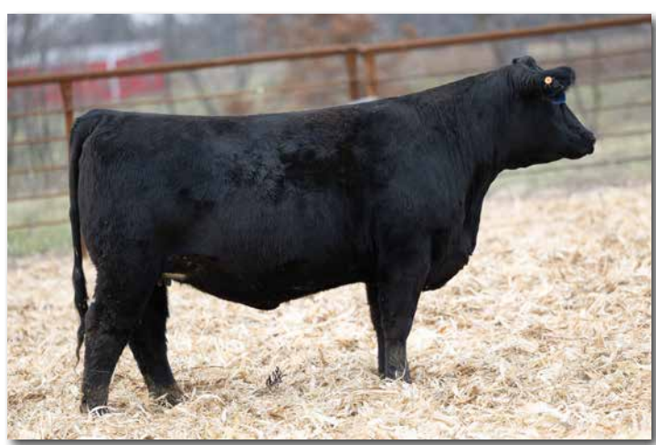
IRON CREEK MS HANDYMAN 23K Sells as Lot 97.

Bred to HA Knockout (4040478). Confirmed safe and due 2/6. Confirmed bull calf. Another Handyman heifer out of a Beacon from the $20,000 TJ Miss 29B cow. Excellent maternal traits of top 25% maternal calving ease, 3% milk and 15% maternal weaning weight, top 4% marbling and 20% API.