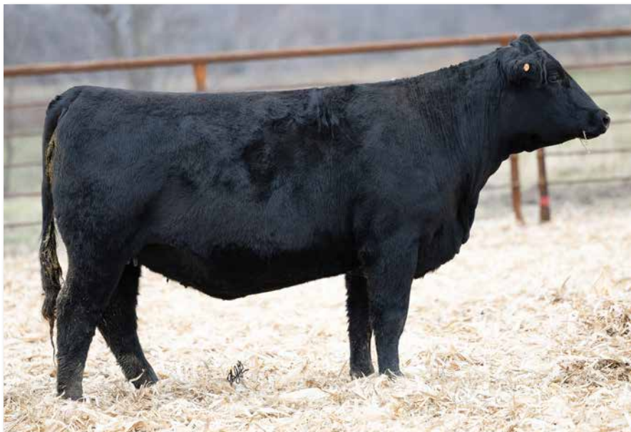
IRON CREEK DRAKE 05K Sells as Lot 76.

One of the best numbered females we have ever offered for sale. Sired by the $100,000 Guardian and out of a full sister to the 50K stud bull, 05K is an elite balance female-top 20% calving ease, 10% weaning, yearling weight and maternal weaning weight, top 1% Stay, 15% marbling with a top 3% API of 178 and 5% Terminal Index. She is a full sister to our donor Moxie and has the same genetic power. Her bull calf by Knockout will have the kind of numbers that bring a lot of money at bull sales- top 10% weaning weight, 15% yearling weight, 1% Stay, 15% marbling, 1% API of 188 and 2% TI of 103!! A donor quality female carrying a seedstock breeding bull.