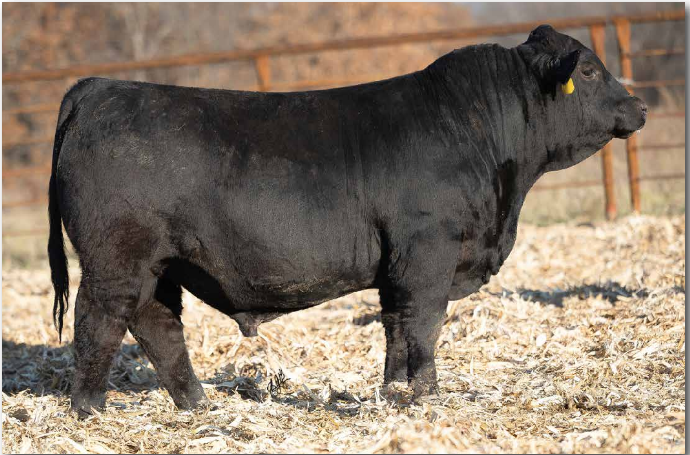
IRON CREEK HIGH NOON 24L Sells as Lot 9.