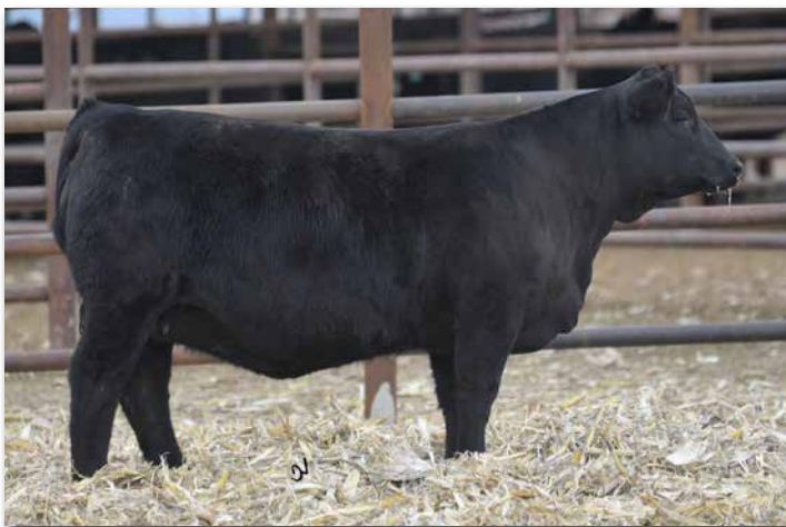
CCR MS 6175 GUARD 1003J Dam of Lot 1.