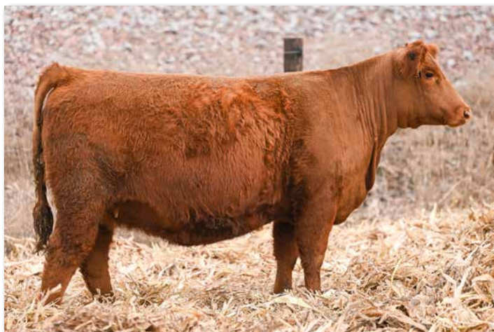
FIVE STAR JAZZY J14

This outstanding red donor is a full sister to Five Star Jackson and carries his broad base of genetic excellence with calving ease in the top 15%, weaning weight in the top 15%, yearling weight in the top 10% and average daily gain top 4%, outstanding maternal traits of top 4% maternal calving ease, 3% milk and maternal weaning weight, top 4% marbling and 20% ribeye area. Combining these numbers with her ideal phenotype yields an exciting donor. Her first calves this year have only raised our excitement and expectations.