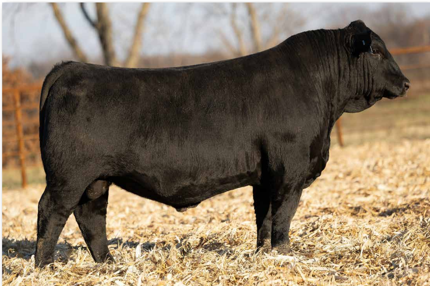
IRON CREEK JESSE 278L Sells as Lot 27.