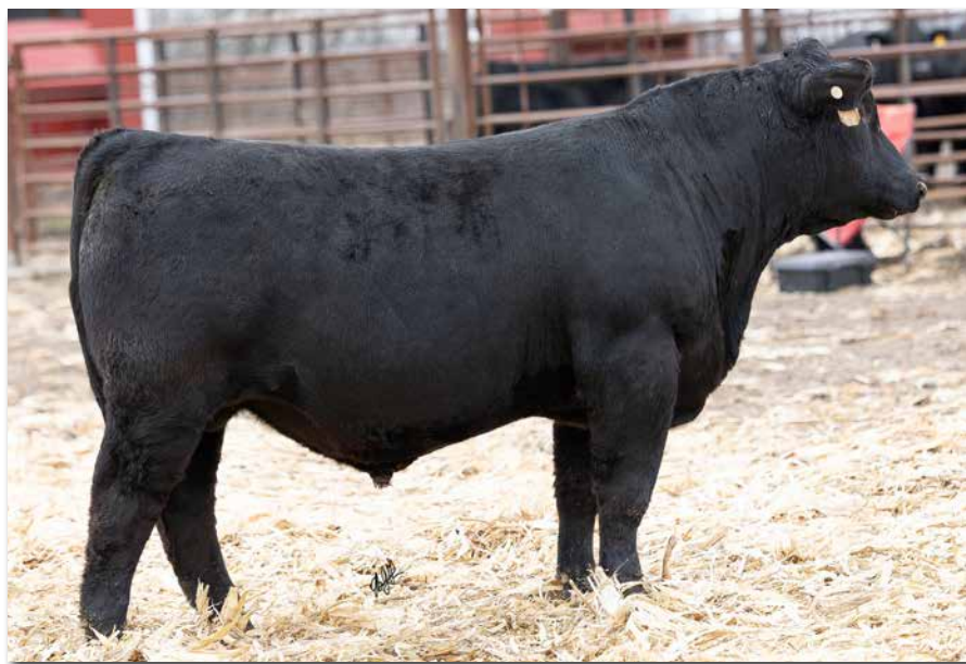
IRON CREEK ESSENTIAL 8225M Sells as Lot 16.

With 10 traits in the top 4% of the breed, this Essential son is an outstanding prospect. Top 1% Average Daily Gain, maternal weaning weight, carcass weight, ribeye area and TI with a top 3% API and top 35% calving ease. Gained 4.62 pounds per day for a 1,359 pound yearling weight.