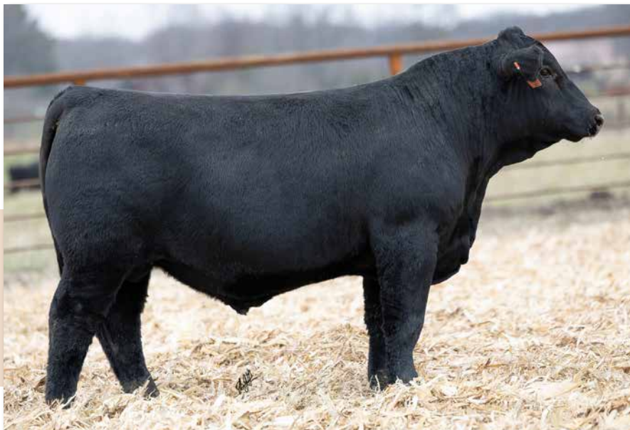
IRON CREEK DEVIL YOU KNOW 013M Sells as Lot 13.

These two Five Star Jackson sons of our Matron donor are exactly what we hoped for in this mating- excellent calving ease, maternal and carcass traits with strong growth, all in an attractive package.