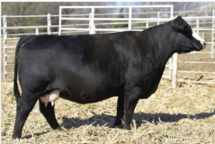
TJ MS 38W Dam of Lot 75.