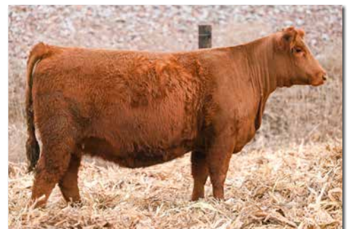
Five Star Jazzy J14 Dam of Lots 25, 26.

A purebred red bull we can't say enough about. He is an ET calf out of the full sister to the $65,000 "Five Star Jackson." Sired by the outstanding W.S. Gadget 40G. A great looking bull with EPDs- CE Top 4%, BW, WW, YW, MWW, and Doc. all in the Top 10%. ADG, Marb, and API all in the Top 15%, MCE top 2%, Milk top 20%, and a 100.3 TI Top 4%. Gain 4.05 lbs. With a YW of 1287.