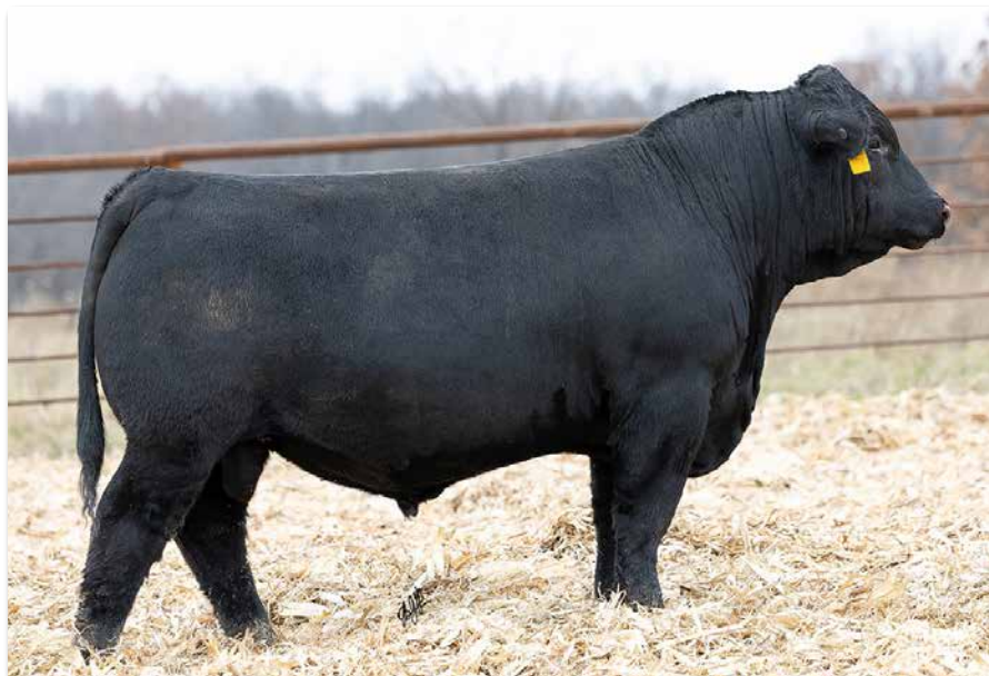
IRON CREEK SWAGGER 16L Sells as Lot 4.

Swagger is an imposing and powerful fall bull with top 10% growth traits, 1% marbling, 4% ribeye area, outstanding Indexes and reasonable calving ease. He is the kind of bull we are proud to offer and would love to have walk our own pastures.