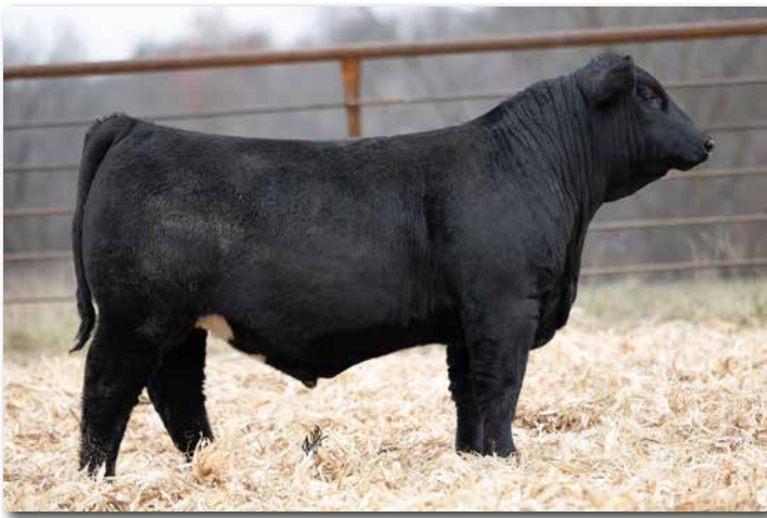
DRAKE JACKSON M122 Sells as Lot 48.