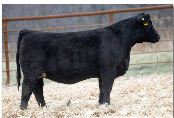
DRAKE MISS G30L Sells as Lot 81.

Bred to Five Star Jackson (3947790). Confirmed safe and due 2/23. Confirmed bull calf.