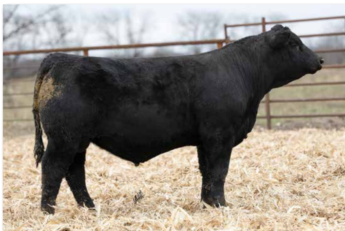
HARLAN BULL K76L Sells as Lot 65.