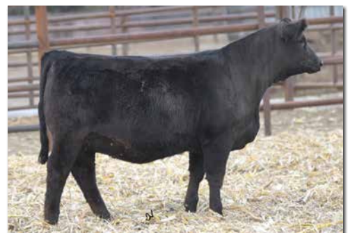
CCR MS 8620 H TOWN 1002J Dam of Lots 18 & 19.

GROWTH!! I believe 3286 is the top weaning weight, yearling weight and average daily gain EPD bull in the sale-elite top 1% EPDs in every one of these traits and top 1% for carcass weight, marbling and Terminal Index with a super strong, top 2%, API of 182. If you are selling pounds and/or quality meat-3286 is your man.