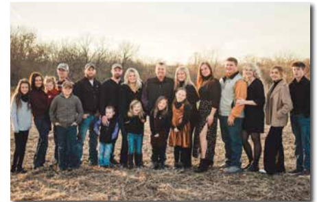
Drake Cattle Company