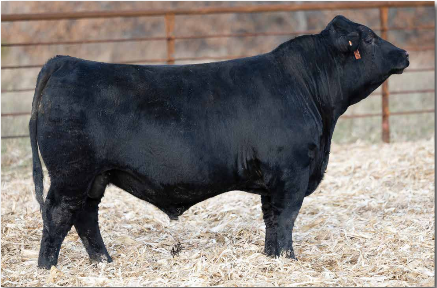
IRON CREEK CHECKMATE 7344L Sells as Lot 6.