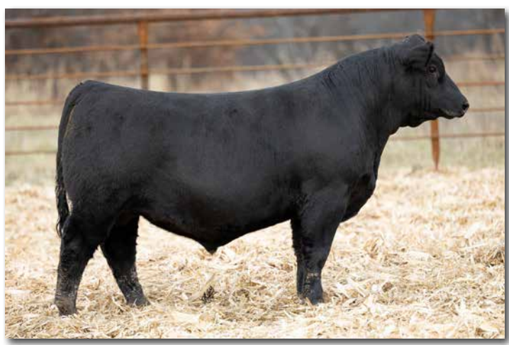
DRAKE BULL G65M Sells as Lot 66.

A Revolution son out of a cow we consider one of our best. Good numbers across the board and he sure has the look. WW 795 lbs and a YW of 1331 lbs.