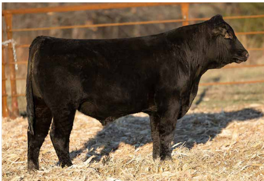
IRON CREEK ESSENTIAL 8630M Sells as Lot 31.

Ok... we admit we didn't do this on purpose. We flushed Crystal to Essential but a little mix up at the lab gave us three Wagyu offspring from this great cow. After a little detective work we determined the lab used Arubial United, an Australia Wagyu bull-described by ABS as the best combination bull in the Wagyu breed. United ranks in the top 5% of the Wagyu breed for growth, carcass weight, marbling fineness and all of the Wagyu Indexes. If you are selling meat directly to consumers, or just want to up your grilling game, 8630M is a unique combination of a high growth, high marbling Simmental crossed with a top Wagyu bull-resulting in a 1/2 Wagyu, 3/8 Simmental, 1/4 Angus- a meat eaters dream! Someone please bid it up on this guy so we can prove Corey wrong.