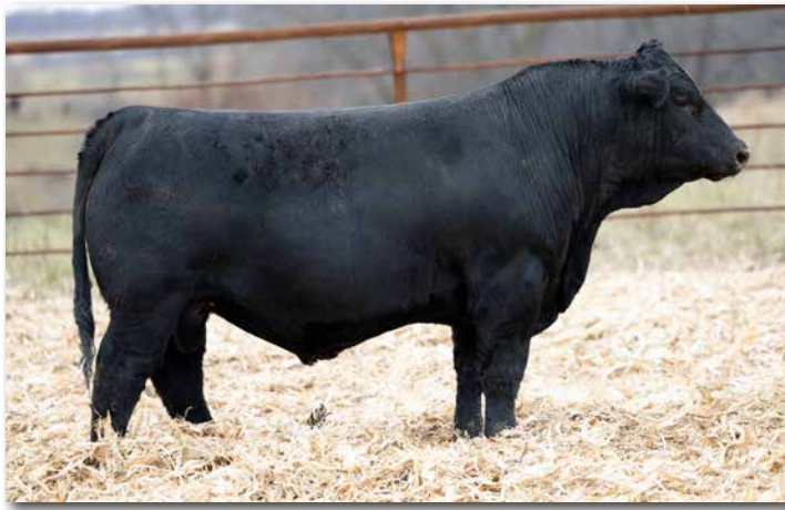
IRON CREEK GENERAL 773L Sells as Lot 63.