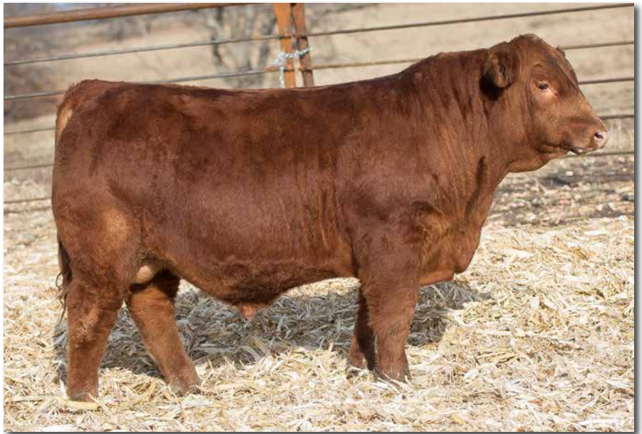
DRAKE BULL M1 Sells as Lot 25.