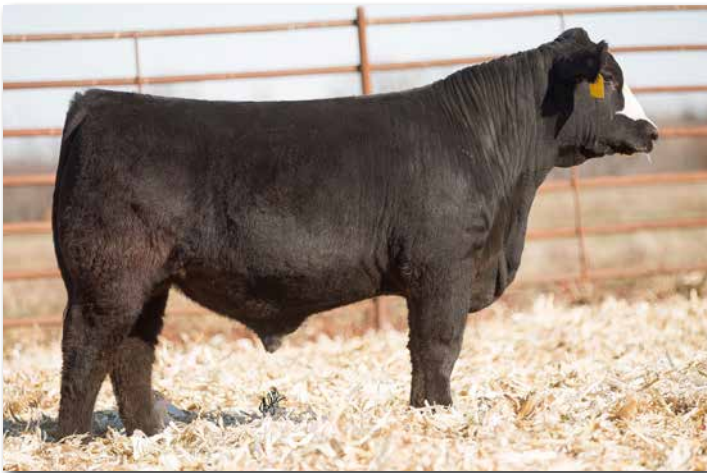
I.C.D. BILLY SUNDAY