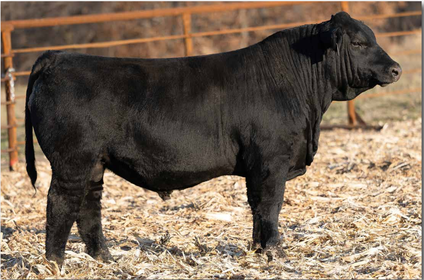
I C DRAKE JET JACKSON 3256L Sells as Lot 22.