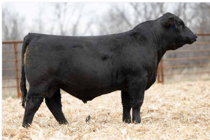
DRAKE GENESIS M4 Sells as Lot 55.