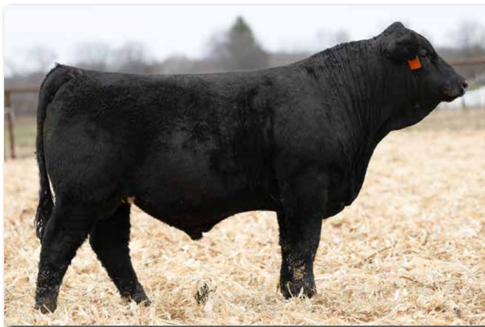
HARLAN BULL H364M Sells as Lot 39/.