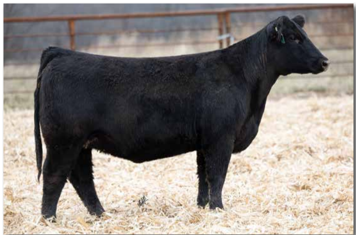
G959L Sells as Lot 88.

Bred to Hook's Eagle (3253742). Confirmed safe and due 2/4. Confirmed bull calf. Another Speak Now female from an excellent Cowboy Cut/Final Answer cow. This girl is in the top 15% of the breed for weaning weight and 20% yearling weight. Her Eagle bull calf will be in the top 10% for WW and YW, top 30% CE and a top 15% API and 10% TI. An excellent female with a herd bull on the way.