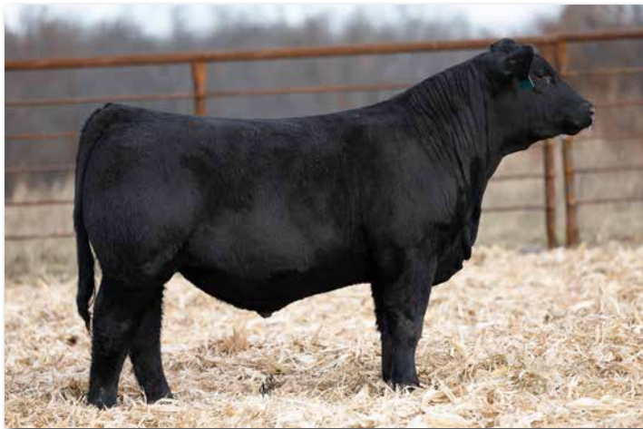
DRAKE BULL A05M Sells as Lot 70.

This is a bull we had at the Iowa State Fair that stood 2nd in a stout class of bulls and was much admired for his power and performance combined with a near flawless phenotype. Great fronted with a powerful hip. One of the top yearling weights at 1462 pounds.