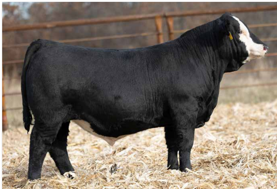
DRAKE BULL K158M Sells as Lot 33.

A really good black white faced bull with great numbers across the board. Twelve numbers in the top 30% or better. Gained 4.44 lbs/day and projected YW of 1350 lbs.