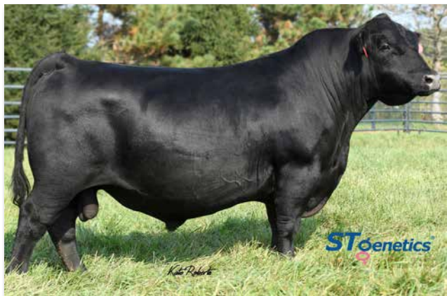
POSS RAWHIDE Sire of Lot 6.