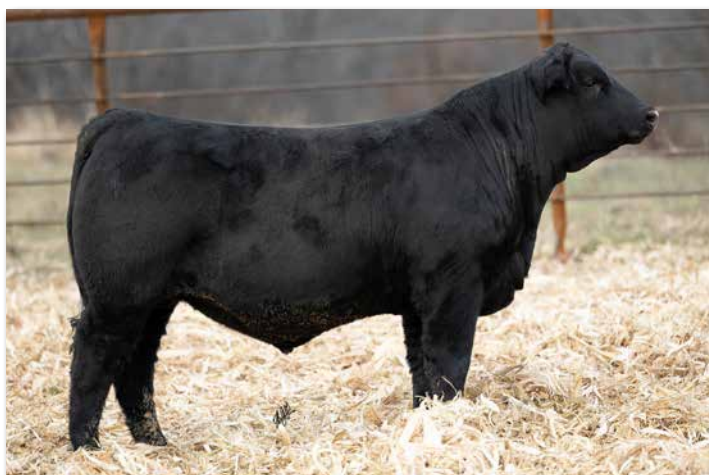
DRAKE BULL 156M Sells as Lot 71.