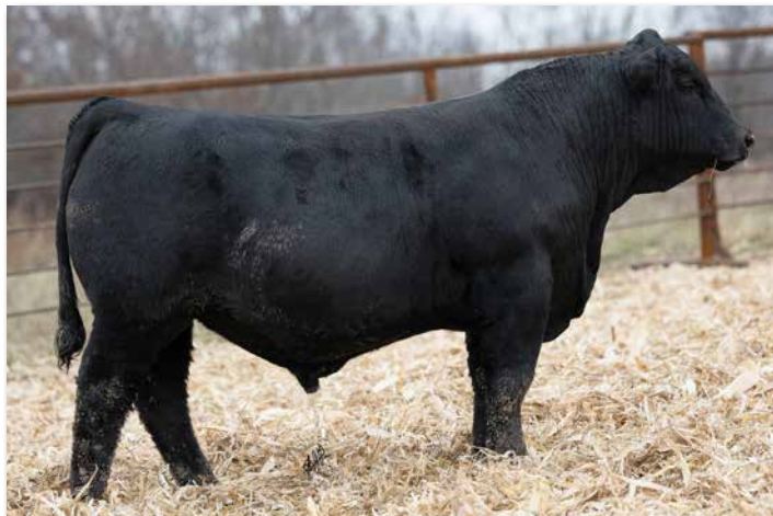
HARLAN BULL K69L Sells as Lot 40.