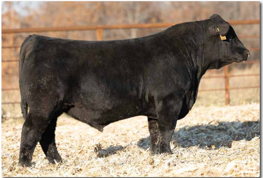
IRON CREEK FOLSOM 049M Sells as Lot 3.

Folsom brings his own top 2% average daily gain, top 4% maternal calving ease, and 1% marbling - with top 10% calving ease! A 191 API and 111 TI round out as impressive a set of numbers as you will see in a bull-all in that now expected attractive Matron x Deadwood phenotype. Posted weaning weight of 782 and gained 4.6 pounds per day for a 1518 pound yearling weight.