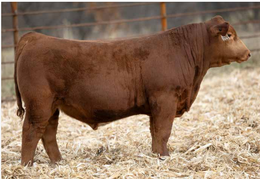
DRAKE BULL M3 Sells as Lot 26.

A purebred red bull we can't say enough about. He is an ET calf out of the full sister to the $65,000 "Five Star Jackson." Sired by the outstanding W.S. Gadget 40G. A great looking bull with EPDs- CE Top 4%, BW, WW, YW, MWW, and Doc. all in the Top 10%. ADG, Marb, and API all in the Top 15%, MCE top 2%, Milk top 20%, and a 100.3 TI Top 4%. Gain 4.05 lbs. With a YW of 1287.