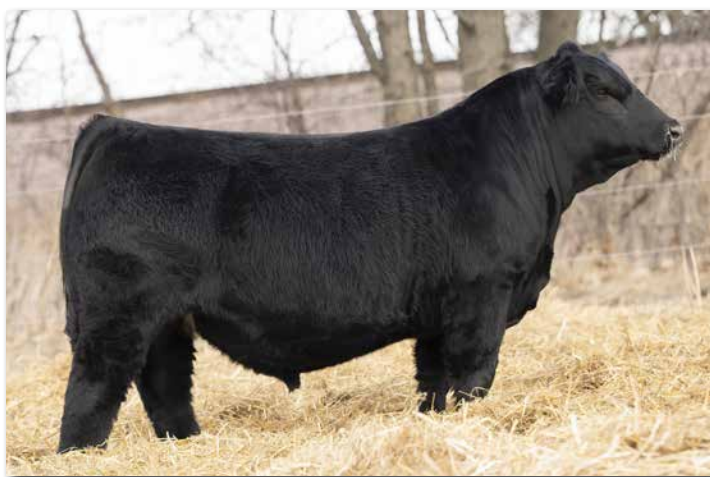
FIVE STAR JACKSON