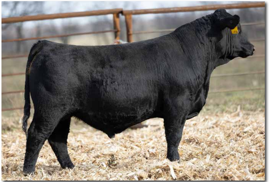
IRON CREEK JACKMAN 313L Sells as Lot 28.