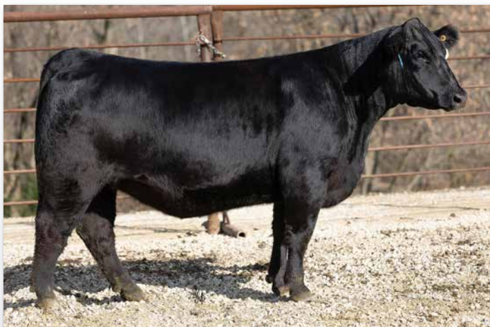
IRON CREEK SMOKE SHOW 131K