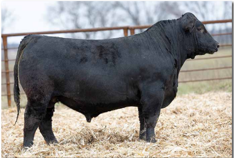
IRON CREEK ASCEND 297L Sells as Lot 7.

Elite balance- top 25% calving ease, 15% weaning and yearling weight, 10-25% on maternal traits, 1-10% on carcass weight, marbling and ribeye area. A beef bull in all respects.