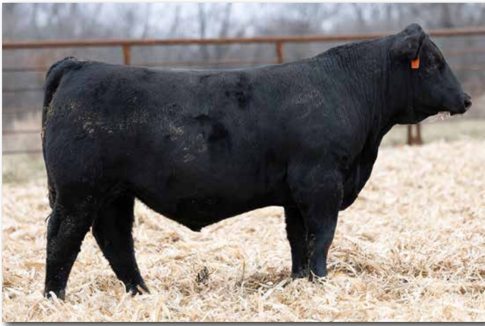
HARLAN BULL K40L Sells as Lot 42.