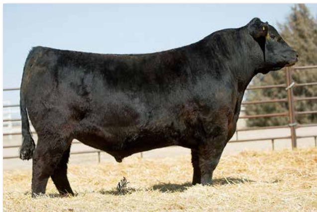
POSS DEADWOOD Sire of Lot 2.