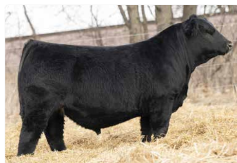
FIVE STAR JACKSON J10 Sire of Lots 13 & 14.

One of our primary goals in breeding decisions is creating repeatable and predictable excellence and this guy represents just that -top 10% calving ease, 25% growth traits, top 2-10% maternal traits, top 2-4% carcass traits and excellent Indexes. And he carries that trade mark Jackson phenotype! 796 pound weaning weigh and 1403 pound yearling weight.