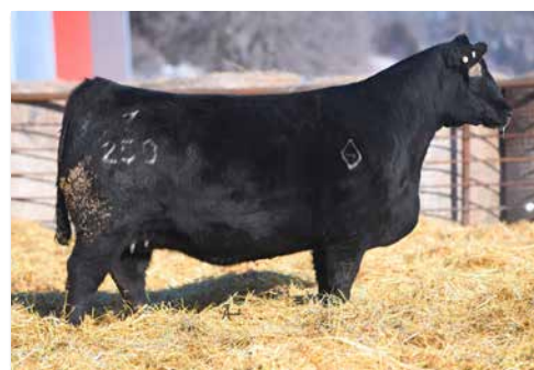
MONTANA BLACKBIRD 7250 Dam of Lots 20 & 21.

Love this bull- 12 traits in the top 15% of the breed including top 15% calving ease combined with top 10% weaning weight, 3% yearling weight and 2% average daily gain. Outstanding maternal traits with top 20-25% ribeye area and marbling. A beast that will add pounds to your calves and give you outstanding daughters that will do the same! GAINED 5.32 POUNDS PER DAY FOR A 1424 POUND YEARLING WEIGHT!