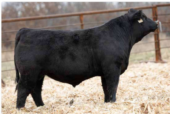
DRAKE BULL H124M Sells as Lot 60.

You will love the look of this guy. Sired by "BSSUM Most Wanted." The top selling bull from the Black Summit sale. We like his kind as they are soft made, easy keeping, and high performing. H124M has a WW of 793 lbs and YW of 1380 lbs.