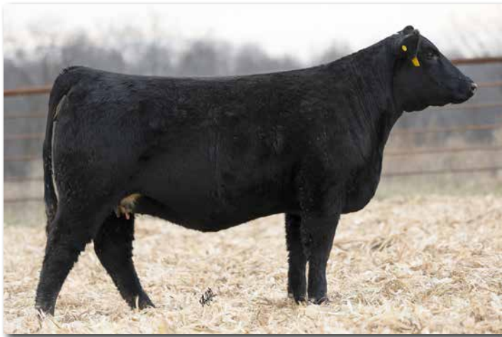
DRAKE MISS ZB185L Sells as Lot 83.

LOT 83 DRAKE MISS ZB185L Black // Polled 3/4 SM 1/4 AN 2/24/2023 ZB185L ASA# 4453554