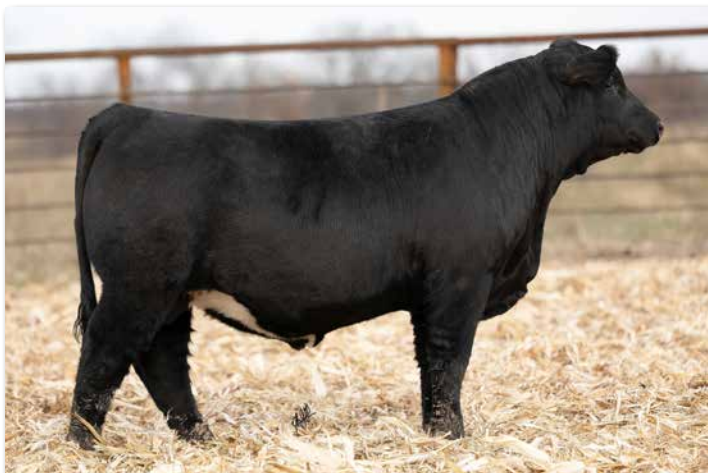
DRAKE BULL 202M Sells as Lot 37.