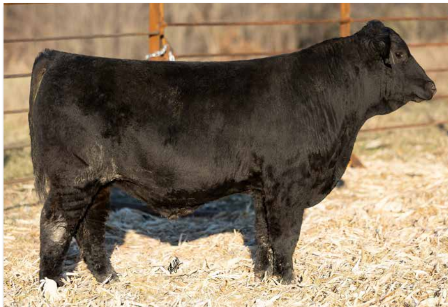
IRON CREEK ESSENTIAL F241M Sells as Lot 29.

A purebred Essential son of Crystal with broad based excellence in his genetic profile. Outstanding calving ease (top 10% CE and top 2% birth weight) with top 10% average daily gain, breed leading maternal and carcass traits, a top 10% docility ranking and top 3% API and 5% TI- an outstanding breeding bull from every angle.