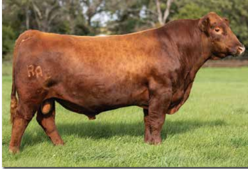
BIEBER JUMPSTART J137 Sire of Lot 25.

One of the most unique bulls we have raised due to his pedigree, EPDs, near perfect phenotype . . . and he is red. Sired by the outstanding Red Angus bull "Bieber Jumpstart J137" and out of "Five Star Jazzy J14," the full sister to the $65,000 "Five Star Jackson." EPDs show him in the top 5% WW, 3% YW, 4% ADG, 5% Milk, 2% MWW, 3% Doc, 10% MCE, 10% TI, 25% CE and BW. He gained 4.93 lbs/day- YW 1385.