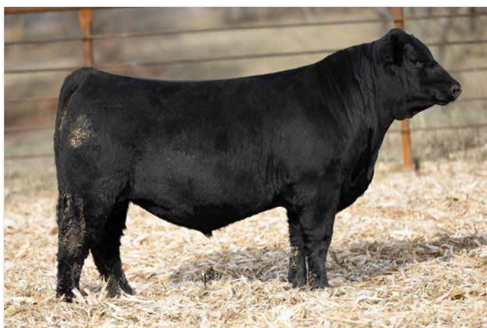
DRAKE BULL G27M Sells as Lot 57.