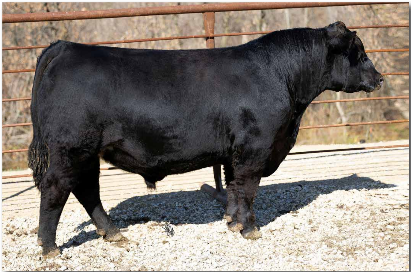
IRON CREEK NOTHING VENTURED Sells as Lot 73.