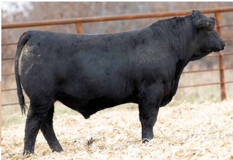
IRON CREEK RAVEN F223M Sells as Lot 20.

Growth and maternal excellence in Raven. Top 1% average daily gain, 2% maternal weaning weight, 5% milk and 25% maternal calving ease. Ideal for the commercial cattle operation that sells its calves by the pound and desires to retain top in females. GAINED 5.57 POUNDS PER DAY FOR A 1585 POUND YEARLING WEIGHT!