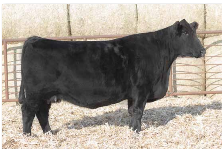
HOOK'S CRYSTAL 1C Dam of Lot 27.

Crystal 1C is an iconic female in the Simmental breed. Her most famous son, Hook's Eagle, is a bull that does more right, more often, than any bull we have ever used. He creates powerful bulls and outstanding producing females and was the most used bull in the entire Simmental breed for a number of years. Crystal consistently passes her massive body and outstanding growth traits to her sons and daughters, and the maternal half brothers to Eagle available in our sale are a genuine opportunity for progressive seedstock and commercial breeders to add the genetics of this unique female to your herd.