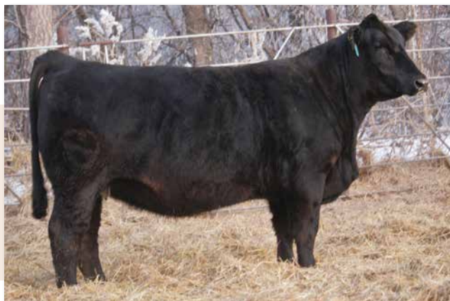
KBHR MATRON OF HONOR F202 Dam of Lot 2.