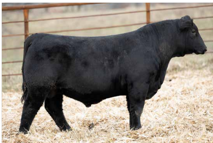
DRAKE BULL D765M Sells as Lot 50.