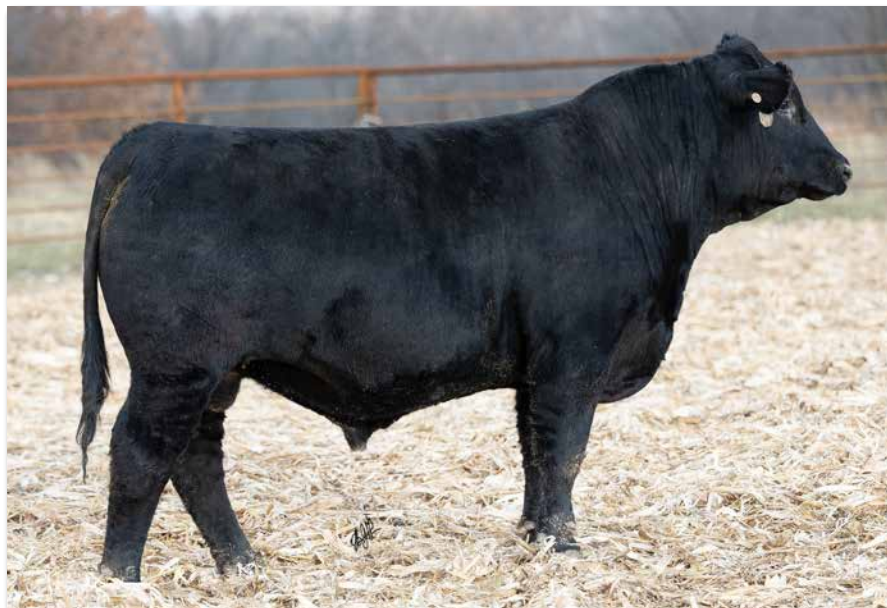
IRON CREEK RIZZ 139L Sells as Lot 8.

Predictable broad based excellence-top 15% calving ease with top 20% growth, excellent maternal traits, top 2% carcass weight, 3% marbling and top 3% API and TI. Rizz can do anything you need a bull to do.