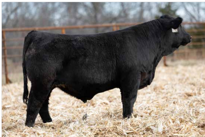
DRAKE BULL H49M Sells as Lot 61.