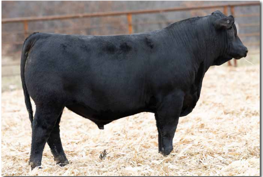
IRON CREEK CLEAR VISION D121M Sells as Lot 11.

A seedstock bull without question- TOP 1% WEANING WEIGHT, YEARLING WEIGHT, AVERAGE DAILY GAIN, CARCASS WEIGHT AND TERMINAL INDEX, with top 35% calving ease, 2% marbling, 5% ribeye area, and a top 3% API. This bull excels in every way possible-unique sire side pedigree for the Simmental breed, a powerful phenotype and breed leading numbers. Gained 5.25 pounds per day to post a 1498 yearling weight.