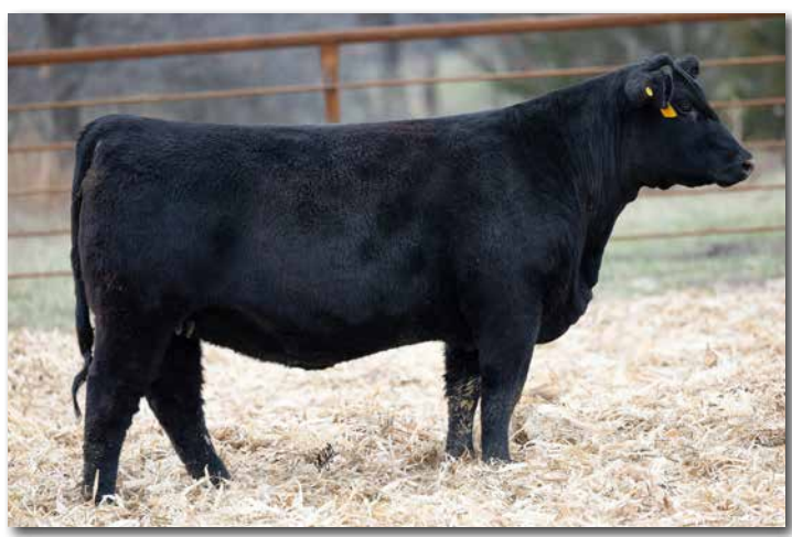
DRAKE MISS 65L Sells as Lot 95.

Bred to TJ Bonafide (3762668). Confirmed safe and due 4/10. A top heifer with EPDs in the top 30%. Planned mating with Bonafied puts the calf in the top 15% of the nine numbers. 65L's dam, TJ108D, is one of our top cows.