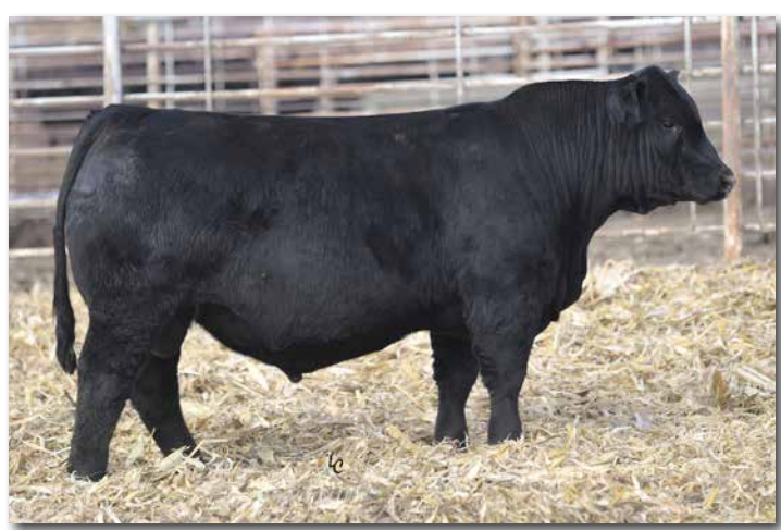
CCR SPEAK NOW 6178G Sire of Lot 82.

Bred to Gibbs Essential (3716905). Confirmed safe and due 2/22. Confirmed bull calf.