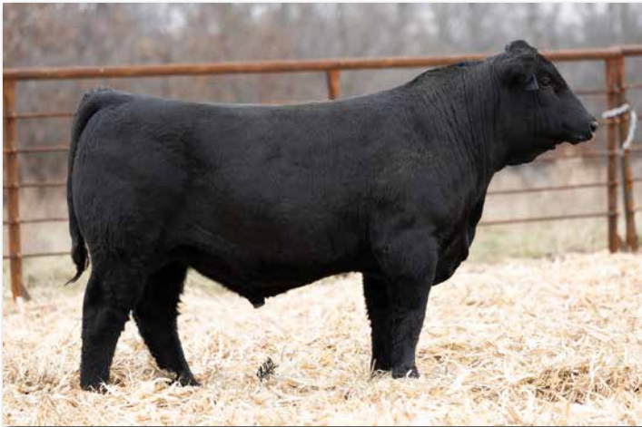
DRAKE JACKSON M48 Sells as Lot 43.