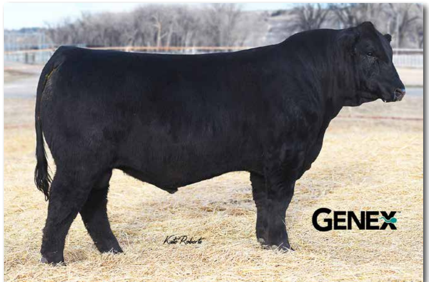
LBRS GENESIS G69 Sire of Lots 54-55.

First class growth, payweight and power can be found in a great set of Genesis sons we have to offer in 2025. The bulls are absolute brutes for power and will be certain to add payweight and value to their progeny. If you are looking to market a heavier more valuable set of feeder calves these Genesis sons should do the trick.