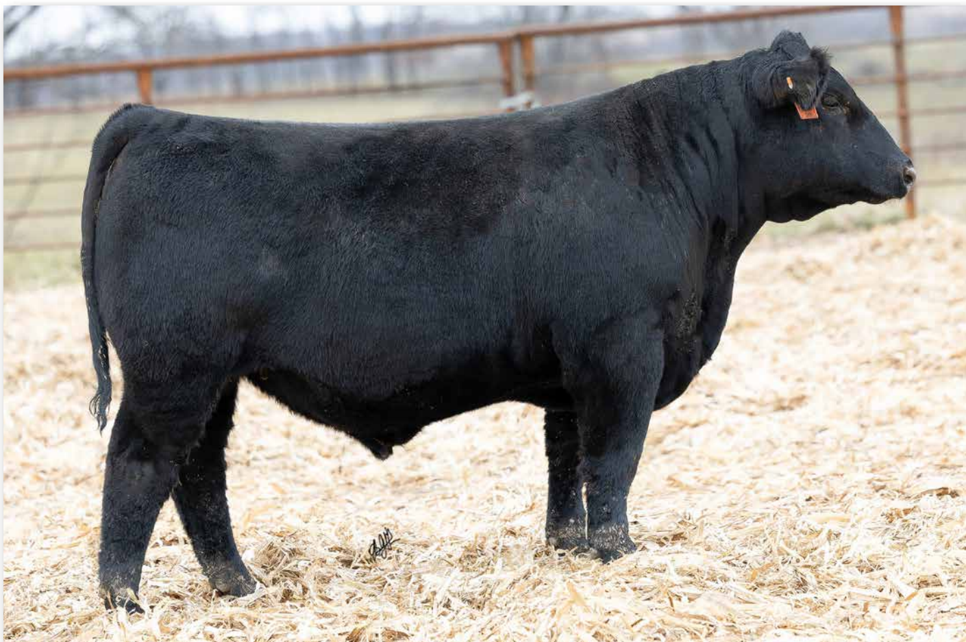
IRON CREEK ALCATRAZ 013M Sells as Lot 2.