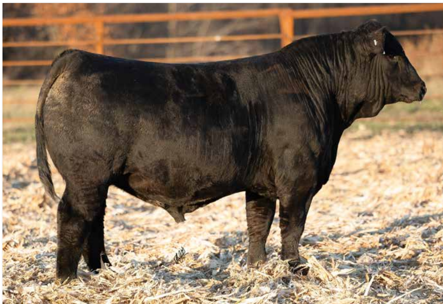
IRON CREEK NEW EAGLE 41L Sells as Lot 30.