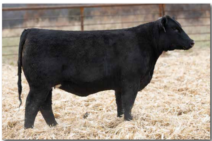
IRON CREEK G22L Sells as Lot 80.

Bred to ES Five Star Limitless (4186927). Confirmed safe and due 2/6. Confirmed heifer calf. Another opportunity for a great breeding female-this Five Star Jackson daughter is out of an Eagle mother and is in the top 20% for calving ease, 15% for growth with a 155 API and top 5% TI! Her Limitless heifer will be an attractive, productive mother cow.