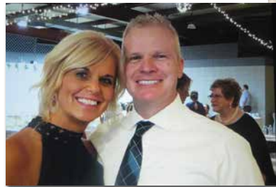
Iron Creek Cattle Co.

Please see page 36 for more information.