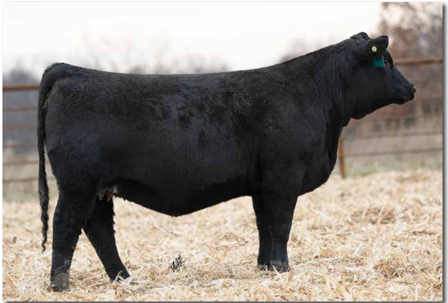
IRON CREEK H349L Sells as Lot 78.