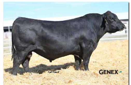
GIBBS 9114G ESSENTIAL Sire of Lots 15 & 16.

With 10 traits in the top 4% of the breed, this Essential son is an outstanding prospect. Top 1% Average Daily Gain, maternal weaning weight, carcass weight, ribeye area and TI with a top 3% API and top 35% calving ease. Gained 4.62 pounds per day for a 1,359 pound yearling weight.