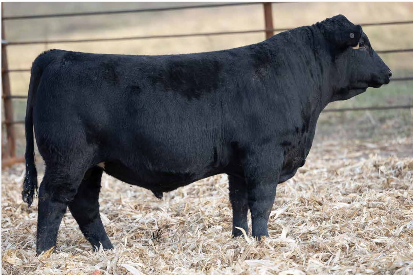
IRON CREEK HOLY SMOKES 010M Sells as Lot 10.