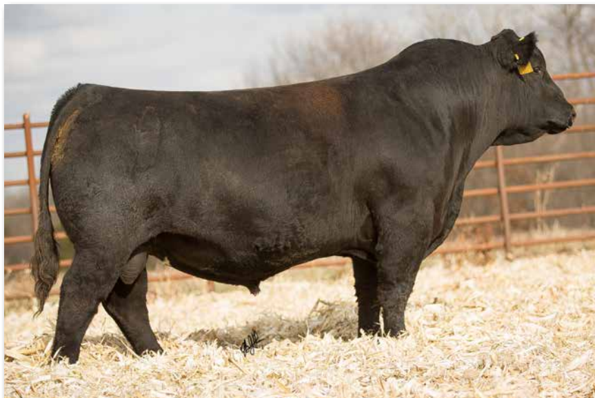
TJ BONAFIDE 647H Sire of Lots 56-59.