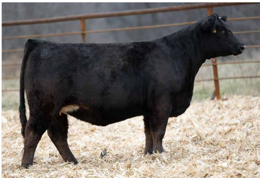
DRAKE MISS D185L Sells as Lot 77.

Bred to Five Star Jackson (3947790). Confirmed safe and due 2/22. Confirmed heifer calf.