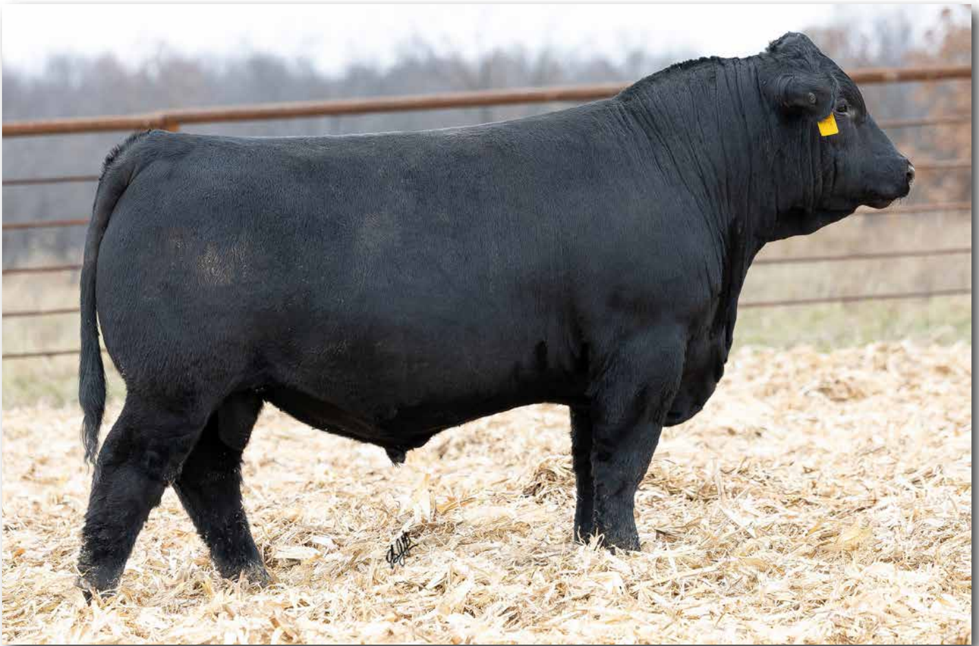
IRON CREEK CHARISMA 31L Sells as Lot 5.