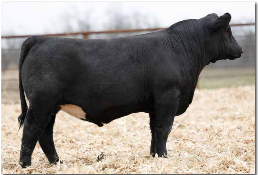
DRAKE BULL K92M Sells as Lot 32.