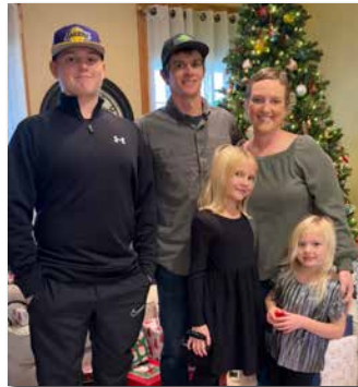
Harlan Cattle Co.