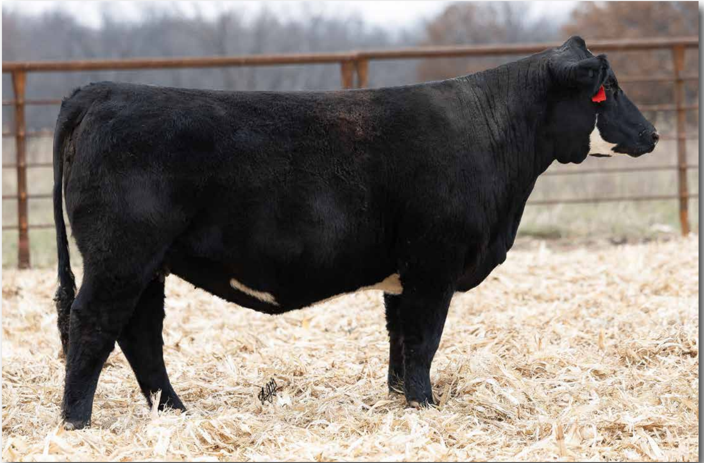
IRON CREEK 38W 26K Sells as Lot 75.