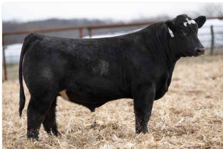
DRAKE BULL A75M Sells as Lot 62.