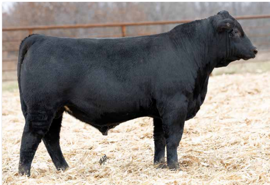
IRON CREEK CLARITY 033M Sells as Lot 12.

It is so much fun to have bulls like these to offer. 033M personifies the broad based genetic excellence that has been our family's goal for 170 years- top 20% calving ease, top 3% growth, top 1% carcass weight, ribeye area and TI, top 2% marbling and API. Gained 4.75 pounds per day and posted a 1388 pound yearling weight.