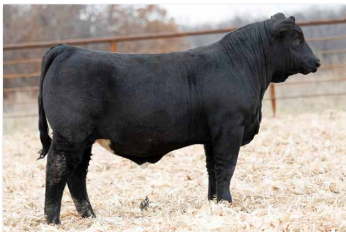
DRAKE BULL J1M Sells as Lot 34.