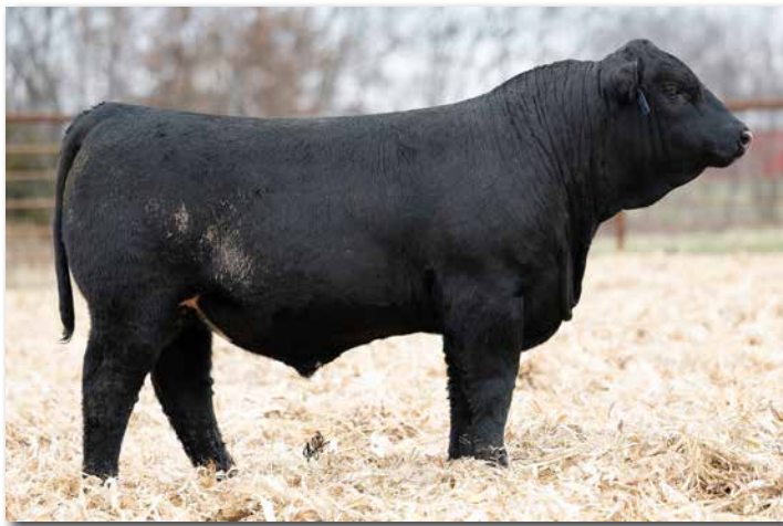
DRAKE JACKSON M30 Sells as Lot 36.