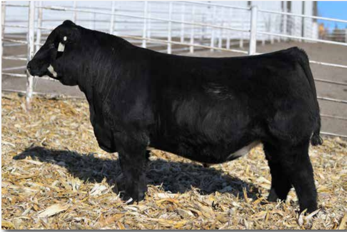
TJ WAR PAINT