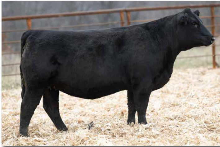
J904L Sells as Lot 99.