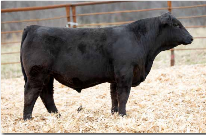
DRAKE BULL G202M Sells as Lot 58.