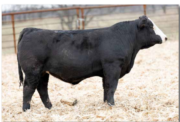
DRAKE BULL K34M Sells as Lot 67.

A powerful son of "Revolution" out of a first calf heifer. Have a look at these numbers. EPDs: WW 105- Top 1%, YW 169.6- Top 1%, ADG 4 Top 1%. He weaned off his first calf dam at 713 lbs. with no creep. He gained 5.22 lbs/day with a 1543 lb. YW. A BWF bull with a load of potential.