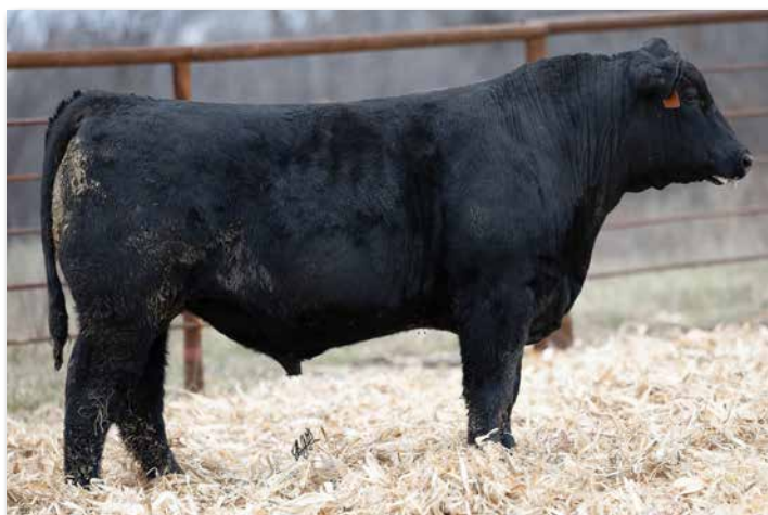
HARLAN BULL K24L Sells as Lot 38.