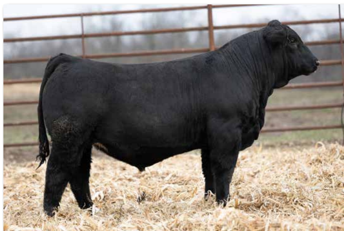
DRAKE BULL B92M Sells as Lot 47.

Should be a good calving ease sire with CE Top 1% and BW Top 3%. Looks like most of our Jackson calves- Big volume, lots of muscle, great feet and legs, and a stunning look. WW 730 lbs with a projected YW 1363 lbs.