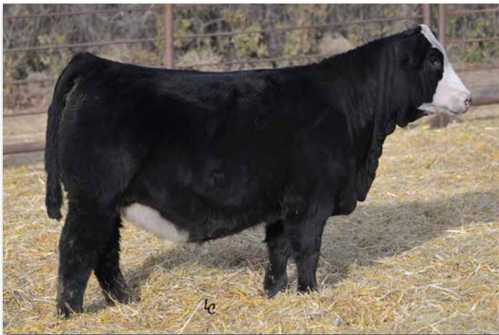
LCDR MS JETTA 93J Dam of Lot 22.