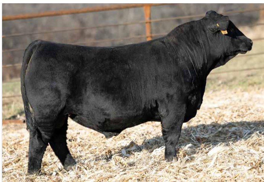
IRON CREEK JACKED UP 1263M Sells as Lot 14.

One of our primary goals in breeding decisions is creating repeatable and predictable excellence and this guy represents just that -top 10% calving ease, 25% growth traits, top 2-10% maternal traits, top 2-4% carcass traits and excellent Indexes. And he carries that trade mark Jackson phenotype! 796 pound weaning weigh and 1403 pound yearling weight.