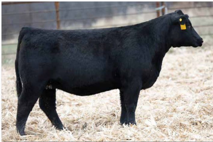
DRAKE MISS F266L Sells as Lot 84.

Bred to HA Knockout (4040478). Confirmed safe and due 2/22. Confirmed bull calf.