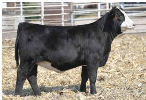
TJ 20H Dam of Lot 76.