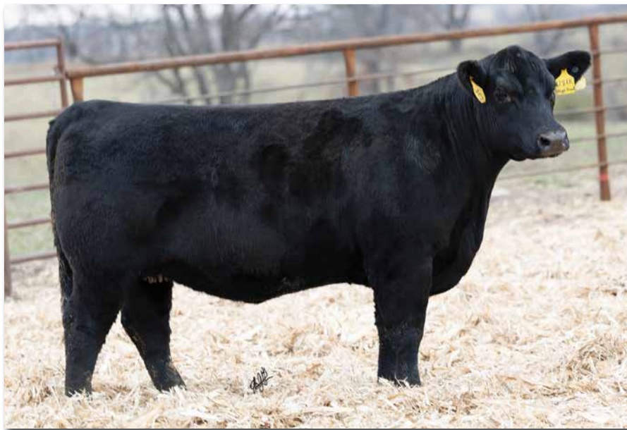
IC/AGR ROAD SHOW 1281K Sells as Lot 79.

If you are raising bulls-or want to- please study Road Show. This female came to us in a unique way. Genex bred an Angus donor to High Road in an effort to produce stud bulls. This one pregnancy was a female-and they didn't need any females. Therefore we purchased the pregnant donor with All Beef and Road Show is the result! In order to wrap up the partnership we decided to offer her as a feature bred at our sale. NOTE SHE IS TOP 3% WEANING WEIGHT AND 1% YEARLING WEIGHT AND AVERAGE DAILY GAIN! She is also top 1% carcass weight, marbling and ribeye area with a 170 API and a top 1% Terminal Index.