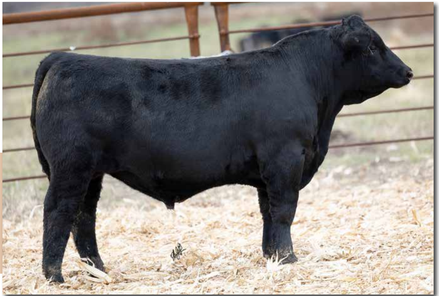
IRON CREEK MR ESSENTIAL 8202M Sells as Lot 15.

It is a pleasure to work on different matings for our Matron donor, as she seems to work so well with every bull. These Essential sons are genomic stand outs. For those cattlemen and women looking for a purebred bull with good looks and outstanding genetic numbers, these guys deserve consideration.