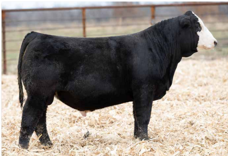
HARLAN BULL 11M Sells as Lot 24.

This Warpaint son is an attractive baldy that has a solid set of EPDs. He also gained 4.4lbs a day.