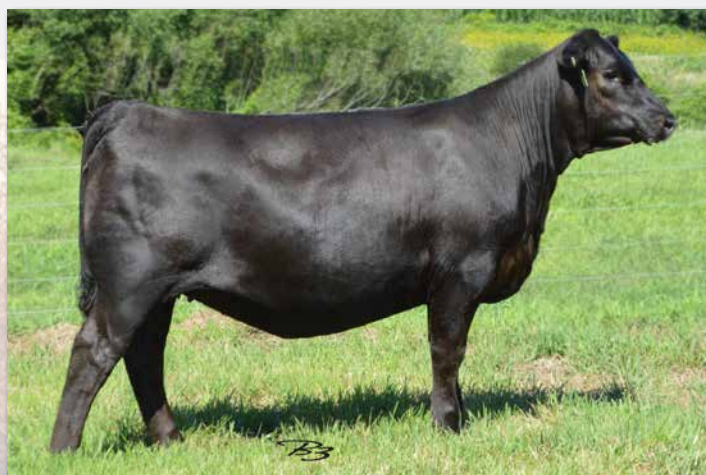
RB LADY BLASTER 412-7532