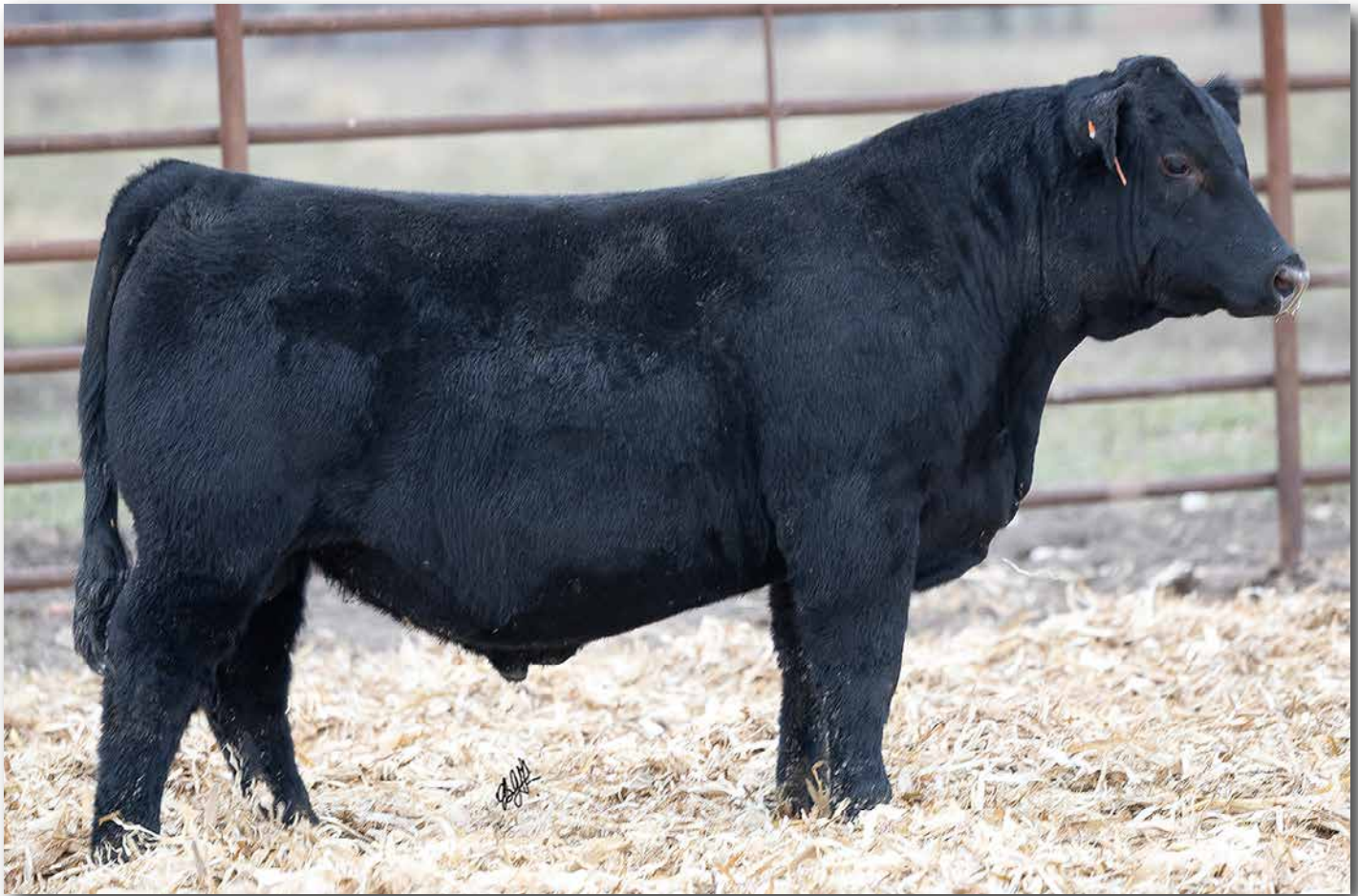
IRON CREEK BUILT DIFFERENT 34M Sells as Lot 1.