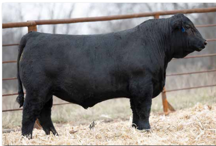
DRAKE JACKSON M121 Sells as Lot 41.